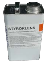
Sizes 5 / 25 / 205 Litres

This dissolves the polystyrene without adversely affecting the surrounding concrete.