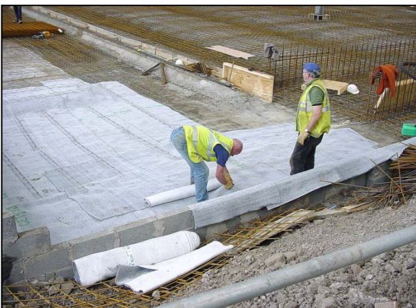
Ease of Installation