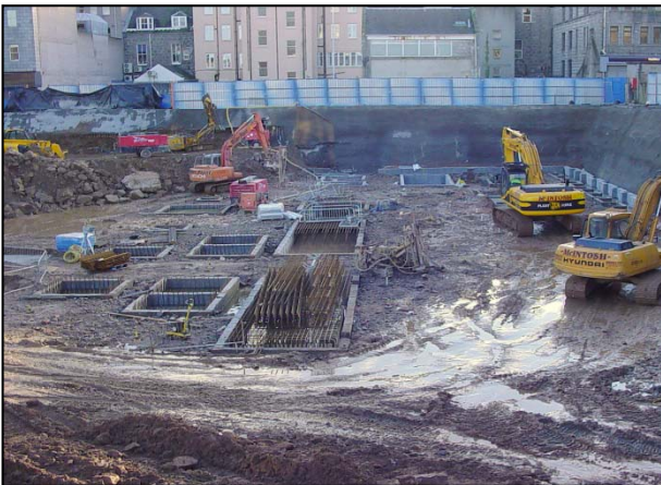
Poor Weather / Ground Conditions